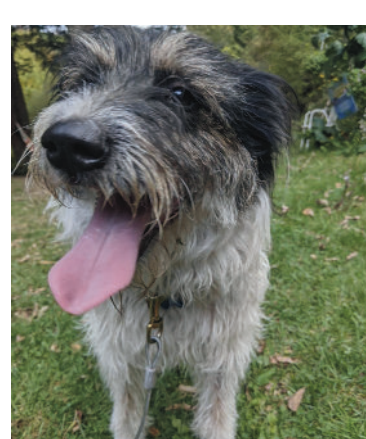
"Clover" Courtesy of Nelson DelTufo