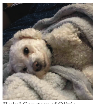
"Lulu"

Overall, pets have many positive benefits. They can reduce loneliness, help you get better at reading and give you a good laugh every once in a while. Pets are a great addition to any family or even just a good companion to have if you live alone.