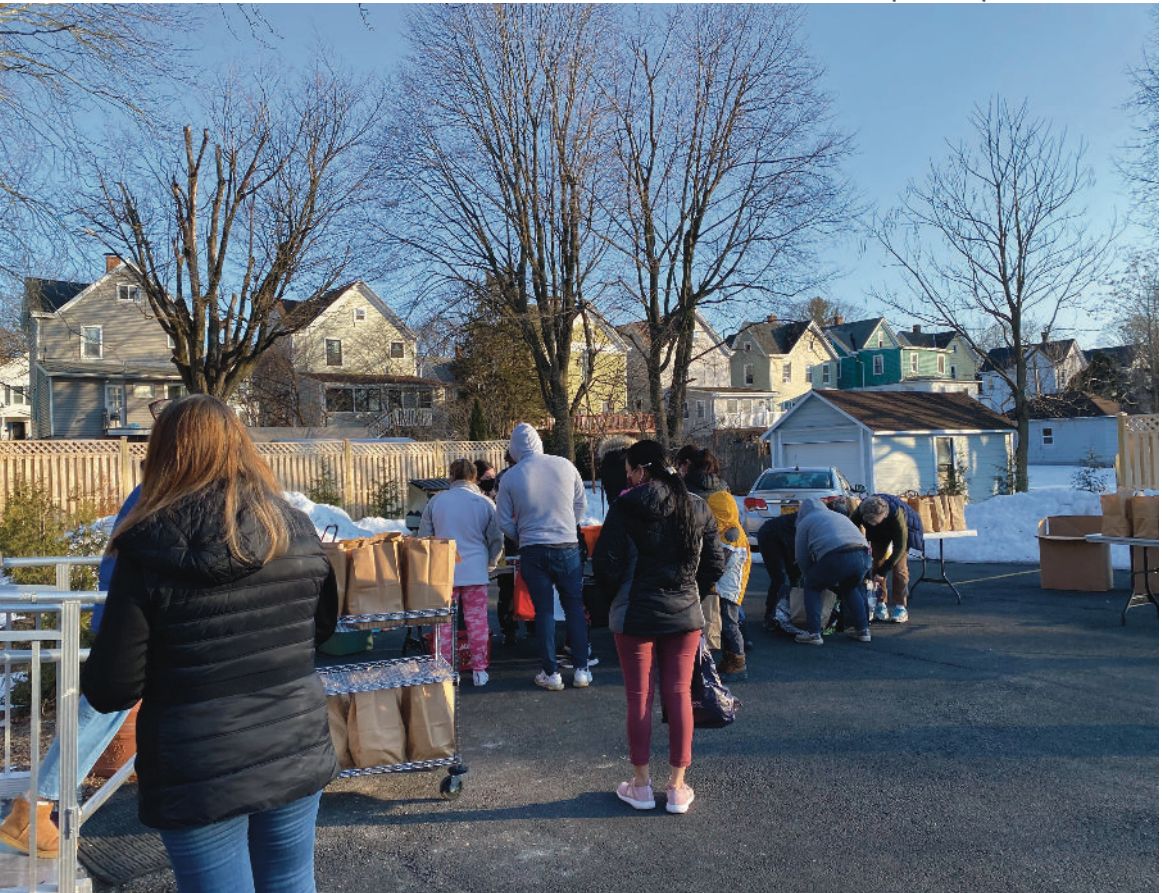
UIDN market, Courtesy of Shayne Durkin

In addition to the market, UIDN volunteers frequently make deliveries to families. In the late fall, UIDN became an official food pantry, which offers more support and resources related to food. There was also a massive Christmas toy drive