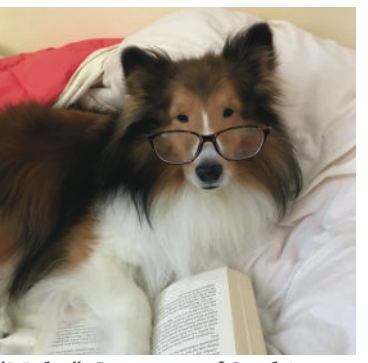
"Moby" Courtesy of Sophia Roberts