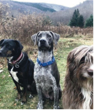
"Echo, Eddie, and Suki"