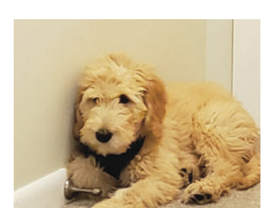
"Aberama"

My friends and I all agree that pets make you happier, but are there any studies to back it up? After some combing through the Internet, I was able to find some.